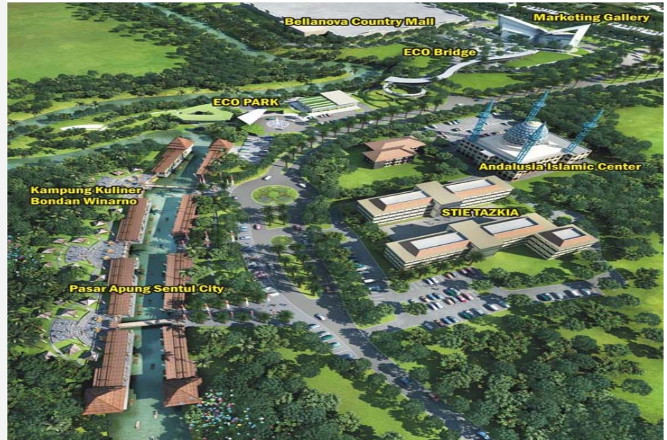
Sentul City Future Plan

BKSL also developing the two world class theme parks, one for middle up segment called World of Wonders in Sentul City and Junglepark in Sentul Nirwana (Joint venture with ELTY) which targeting the middle low segment. These will generate recurring income for BKSL in the long term as they will also build mall and 5 stars condotel there.